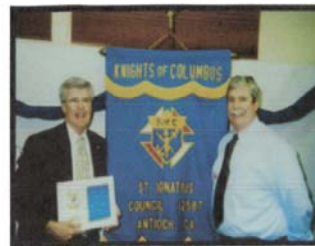
Memories.... The St. Ignatius Knights of Columbus Council