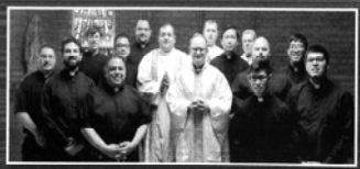
The Seminarians of the Diocese of Oakland present

YOUNG MEN AGES 13-18 ARE INVITED TO JOIN US FROM JULY 15-18, 2018