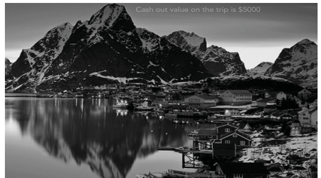
Cash out value on the trip is $5000