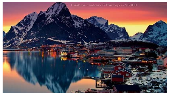
Cash out value on the trip is $5000